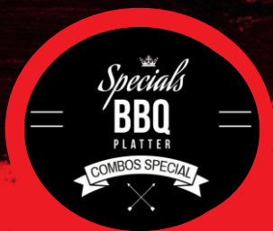
Table for one

Lone Ranger: 250g of BBQ Pork Ribs, Portion of Mash Potatoes, Half a Portion of Potatoes Salad, Third of a Portion of Cole Slaw, Sweet Corn, Baked Beans and 1 Grilled Sausage or Classic Hotdog