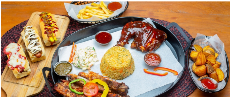
Table for Three

Dirty Cowboy :500g of BBQ Pork Ribs, 2 Portions of Jollof or Fried Rice , 1 Portion of Yam Chips or French Fries, 3 Hotdogs and 12 Pcs of Grilled Wings (Pork ribs can be substituted for Equivalent of Lamb Bits)